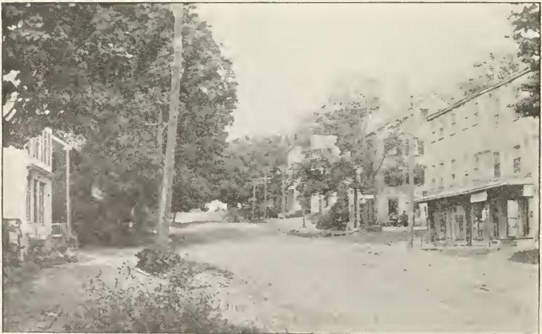
Main Street, South Windham, Maine

Under these adverse circumstances, doubtless many of the grantees became disheartened and either sold their home lots or transferred them to others, who would perform the conditions originally imposed by the Great and General Court. A few, however, decided to settle on their grants and make permanent homes in this wilderness.